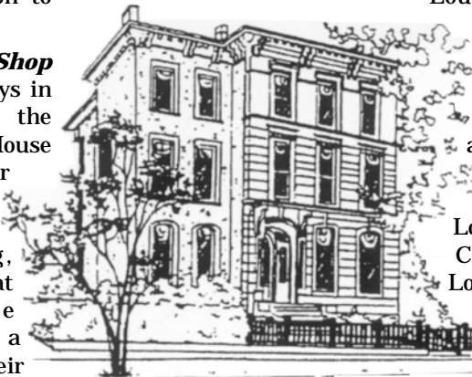
Sneak peak of one of the homes on tour this year!

Volunteers are always needed to help make this fundraiser for the of the Old Louisville Information Center and "The Old Louisville Journal" a success. Please call the Information Center to offer your help with this event.